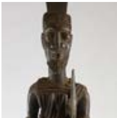
Caryatid Veranda Post , 20th century Olowe of Ise (Yoruba, ca. 1873–1938) Nigeria; Yoruba peoples Wood, pigment; H. 71 in. (180.3 cm) Purchase, Lila Acheson Wallace Gift, 1996 (1996.558)