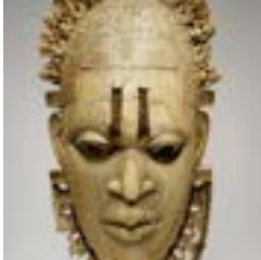
Pendant Mask: lyoba , 16th century Nigeria; Edo peoples, Court of Benin Ivory, iron, copper (?); H. 9 3/8 in. (23.8 cm) The Michael C. Rockefeller Memorial Collection, Gift of Nelson A. Rockefeller, 1972 (1978.412.323)