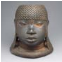
Head of an Oba , 16th century (ca. 1550) Nigeria; Edo peoples, Court of Benin Brass; H. 9 1/4 in. (23.5 cm) The Michael C. Rockefeller Memorial Collection, Bequest of Nelson A. Rockefeller, 1979 (1979.206.86)